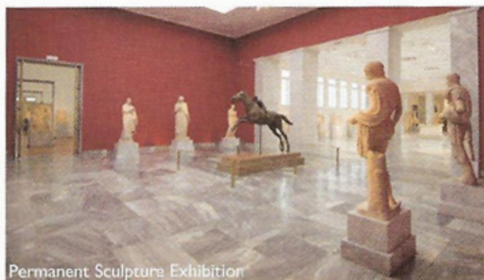
Permanent Sculpture Exhibition

"Honorary Report in the work of Giorgos Zoggolopoulos " Athens International Airport, Eleftherios Venizelos, Tel. 210 353 0000 With the aid of Georgios Zoggopoulos Foundation. 6 June 2008 - 31 January 2009 Entrance: Free