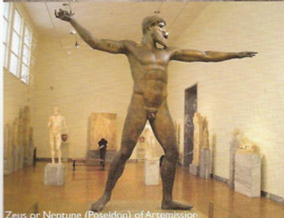
Zeus or Neptune (Poseidon) of Artemision